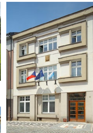
Municipal Authority building (District Savings Bank) (VP18)