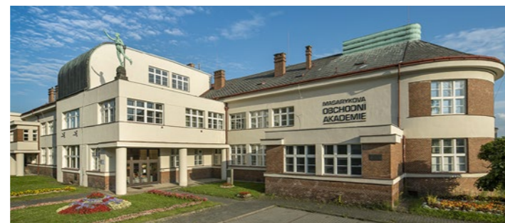
Commercial College (today's Masaryk Business Academy) (VP220)