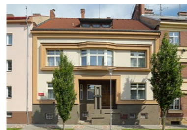
Vlach House (VP501)