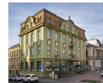
Hotel Praha (VP310)

executed in Art Nouveau stylised crosses, which has no equivalent elsewhere in Jičín. From the intersection of Vrchlického and Husova, the route makes a detour to another unique building – a Protestant chapel, built as part of the villa of entrepreneur Bohuslav Mareček (VP289) (Konecchlumského 289). The way back to the centre follows Husova Avenue, where our gaze is directed to building no. 322 (VP322) with its sgraffito decorations, and in particular to Hotel Praha. On Božena Němcová Street you can see today the still well-preserved building of the municipal baths, continuing to serve its original purpose. Two further branches of the route take you to Smetanova Street and especially out to the suburb of Letná, behind Kníže Pond, where the villa built for Theodora Němcová according to a design by Dušan Jurkovič catches the eye. Next-door is the Jakubec villa, one of few buildings erected in the first two decades of the 20th century to have entirely escaped the slightest whiff of Art Nouveau or any historicising style (HP157) (Maršála Koněva Street 157, 1911, Pavel Janák).