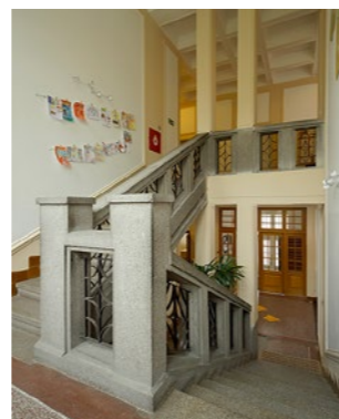
Student House (today's Václav Čtvrtek Library) (VP400)