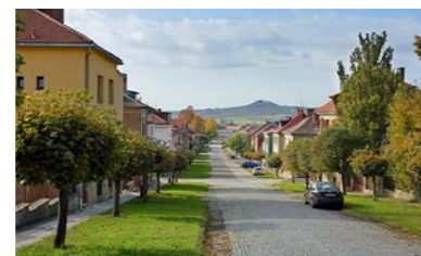
Čeřovka – a garden city, Foersterova Street (F)