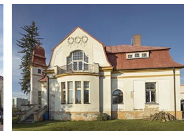
Mareček villa – Chapel of the Evangelical Church of Czech Brethren (VP289)